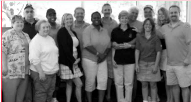
Vinni Golf Committee gather for a group photo.

Get your clubs ready for the 2010 outing on June 4th!