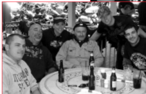
2009 Biker Events raise Big Money!