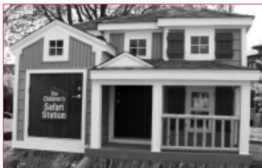
Pulte Safari Playhouse

Congratulations one and all – and thanks to everyone who purchased a ticket – it ALL helps RMH/Detroit!